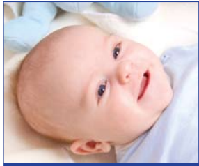
Highest quality water for use with baby formula.