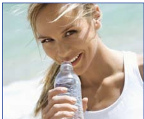
Guaranteed pure, clear, great tasting top quality drinking water.

Osmosis is a natural process. Walls of plant cells form natural membranes, allowing water to pass much more readily than dissolved minerals. The less concentrated solution in the soil seeks to dilute the more concentrated solution in the plant causing the water passage through the membrane. In reverse Osmosis, the pure water passes through the membrane to the less concentrated solution on the pure water side of the membrane.