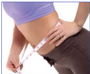
Ideal for low sodium diets and weight loss programs.