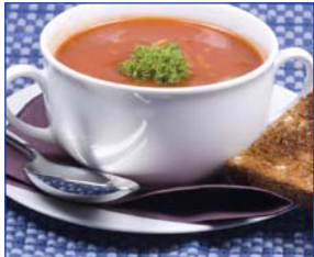
Guarantees better tasting beverages.